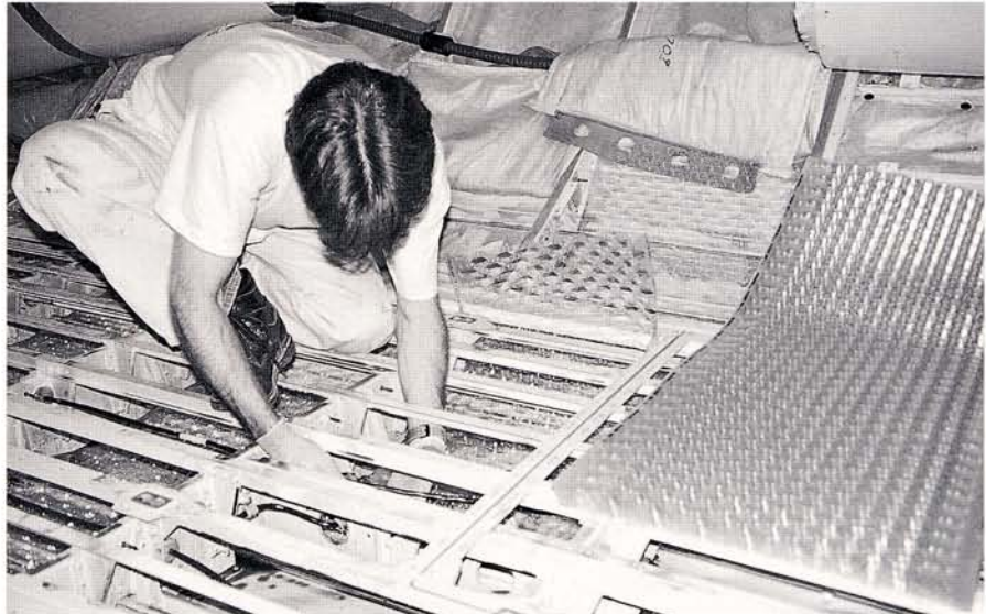
Typical Dryliner Installation

Over 200,000 sheets of Dryliner are currently flying worldwide on the following aircraft: